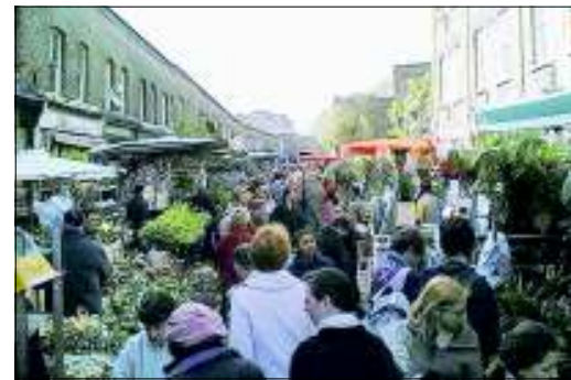
SWEET SMELLING STREET: The Columbia Street flower market in East London

● Would you like to see your favourite holiday featured here? Email or write to Steve Race - address below - with your answers to the questions above. Or go to www.gazettelive.co.uk/travel and fill in the form online.