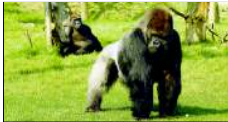
SURF AND TURF: On the London RIB Voyages trip, above, and below - Gorilla Kingdom at London Zoo

next day it was time for a river cruise to the Southbank Centre, home of the Royal Festival Hall. The complex has recently had a multi-million pound refurbishment, and from the lively atmosphere of the outside spaces, it looks like increasing numbers of people are enjoying the buzz of this greatly improved area.